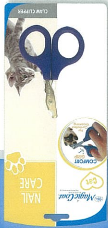
10053070 Nail Care Claw Clipper