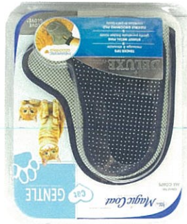
10052867 Deluxe Love Glove