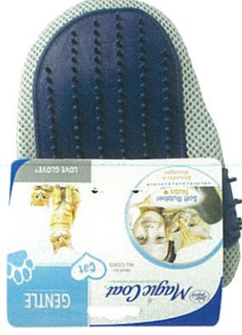
100530703 Love Glove