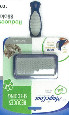
10052821 Reduces Shedding Slicker Brush