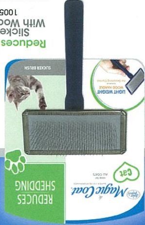
10052825 Reduces Shedding Slicker Brush With Wood Handle